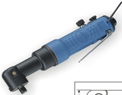
OP-311LHA F Rear exhaust 後排氣